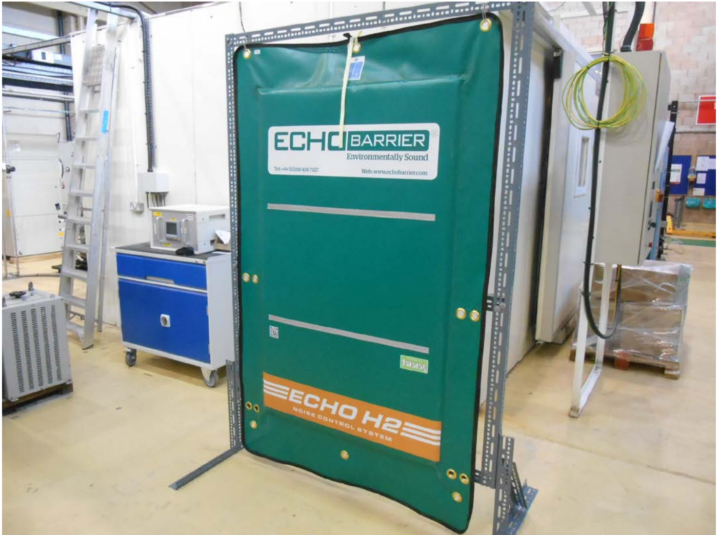
SPECIMEN AFTER TESTING