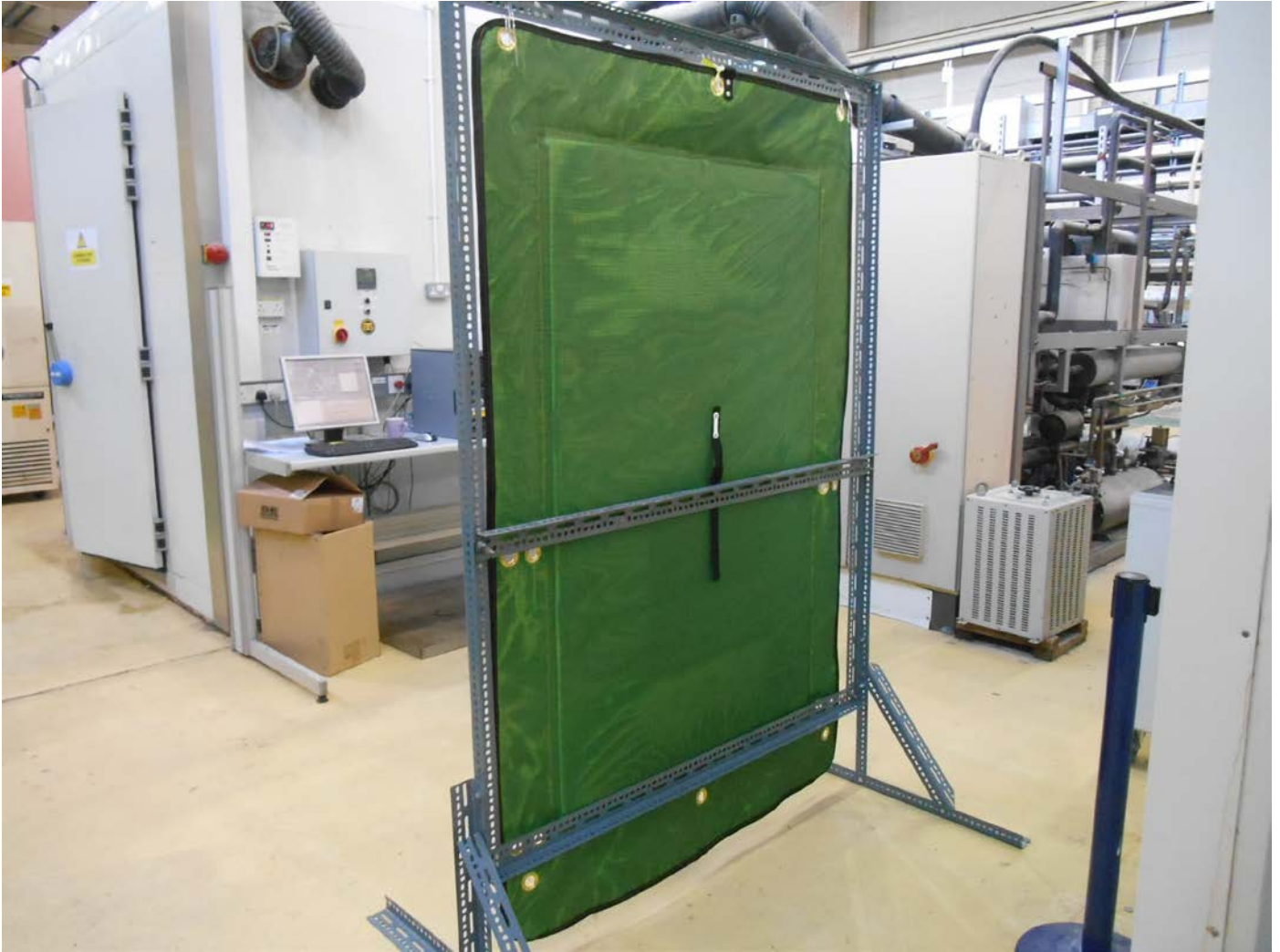
SPECIMEN AFTER TESTING