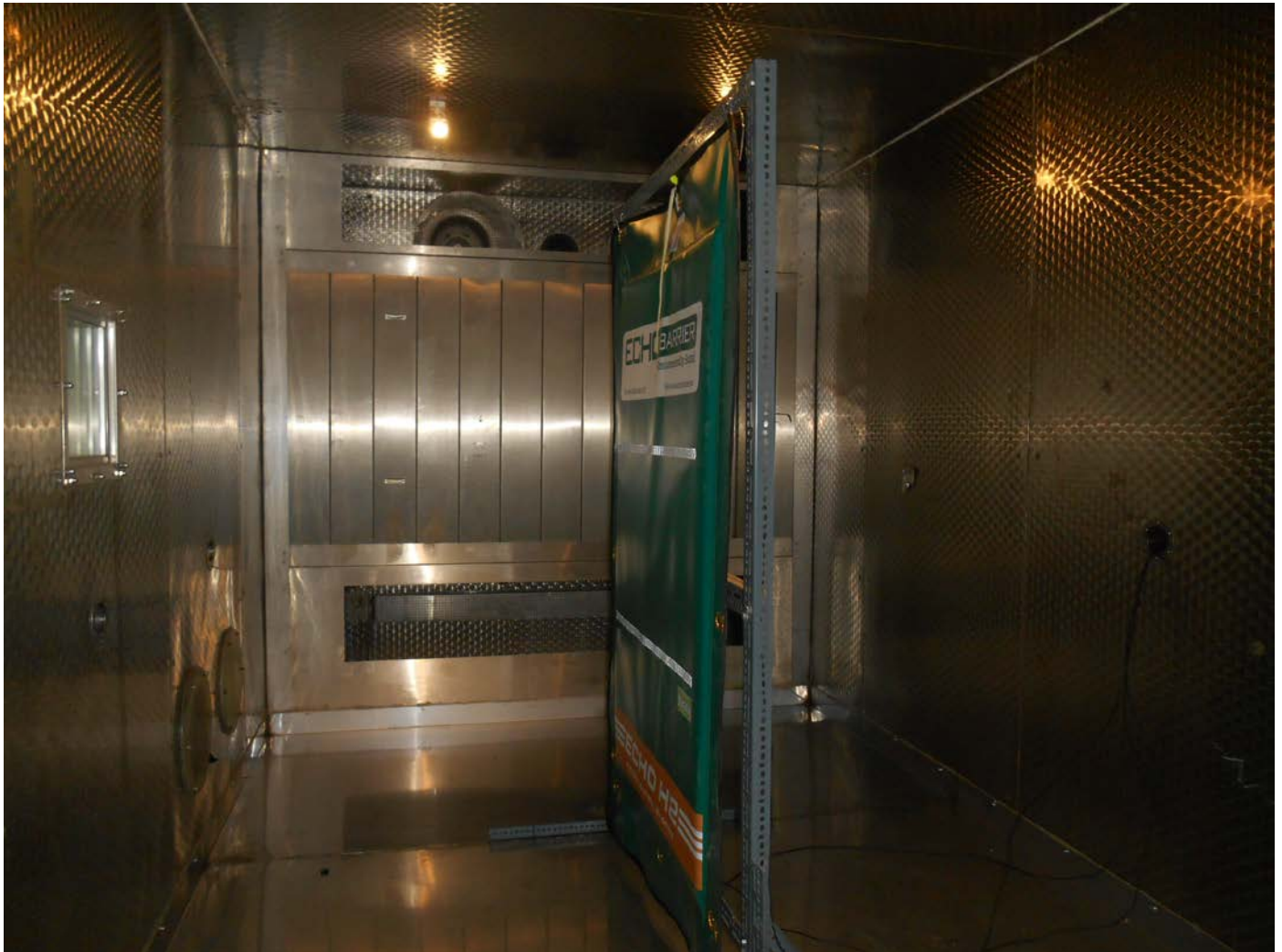
SPECIMEN MOUNTED IN CLIMATIC CHAMBER PRIOR TO TESTING